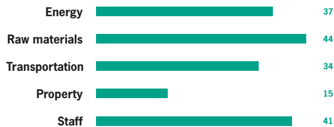
Figure 2: Major impacts on cost pressures